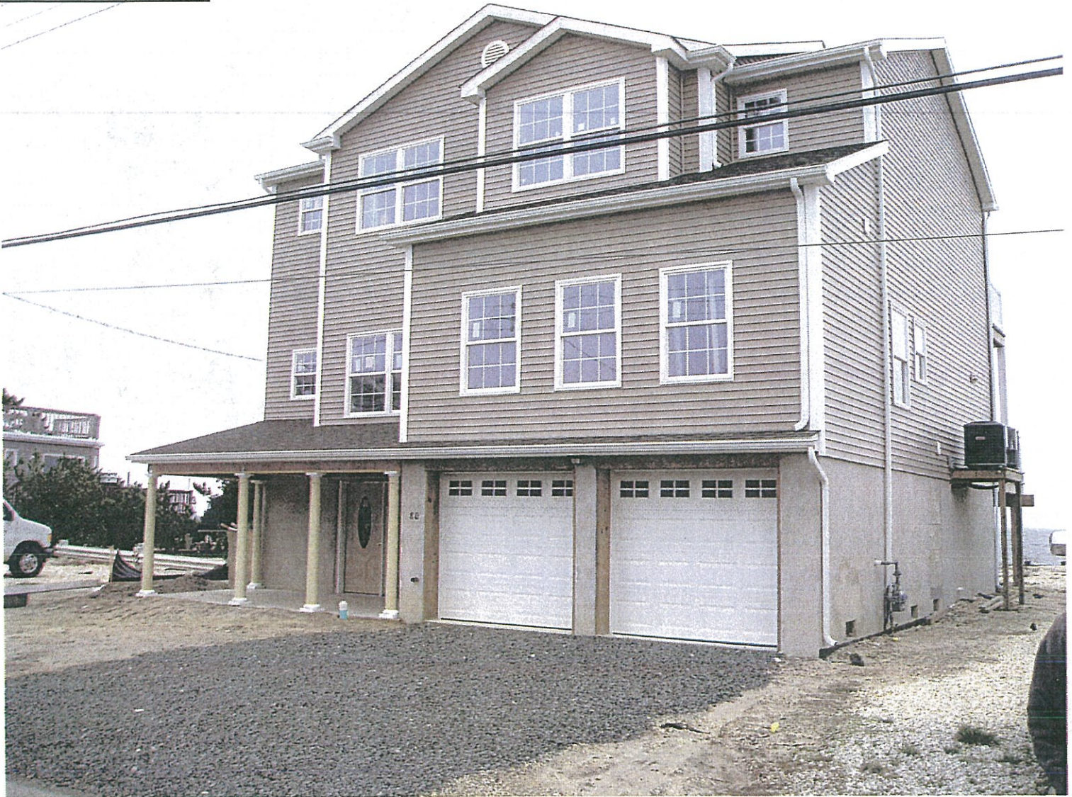
FRONT VIEW (4/7/2008)

If using the Elevation Certificate to obtain NFIP flood insurance, affix at least two building photographs below according to the instructions for Item A6. Identify all photographs with: date taken; "Front View" and "Rear View"; and, if required, "Right Side View" and "Left Side View." If submitting more photographs than will fit on this page, use the Continuation Page, following.