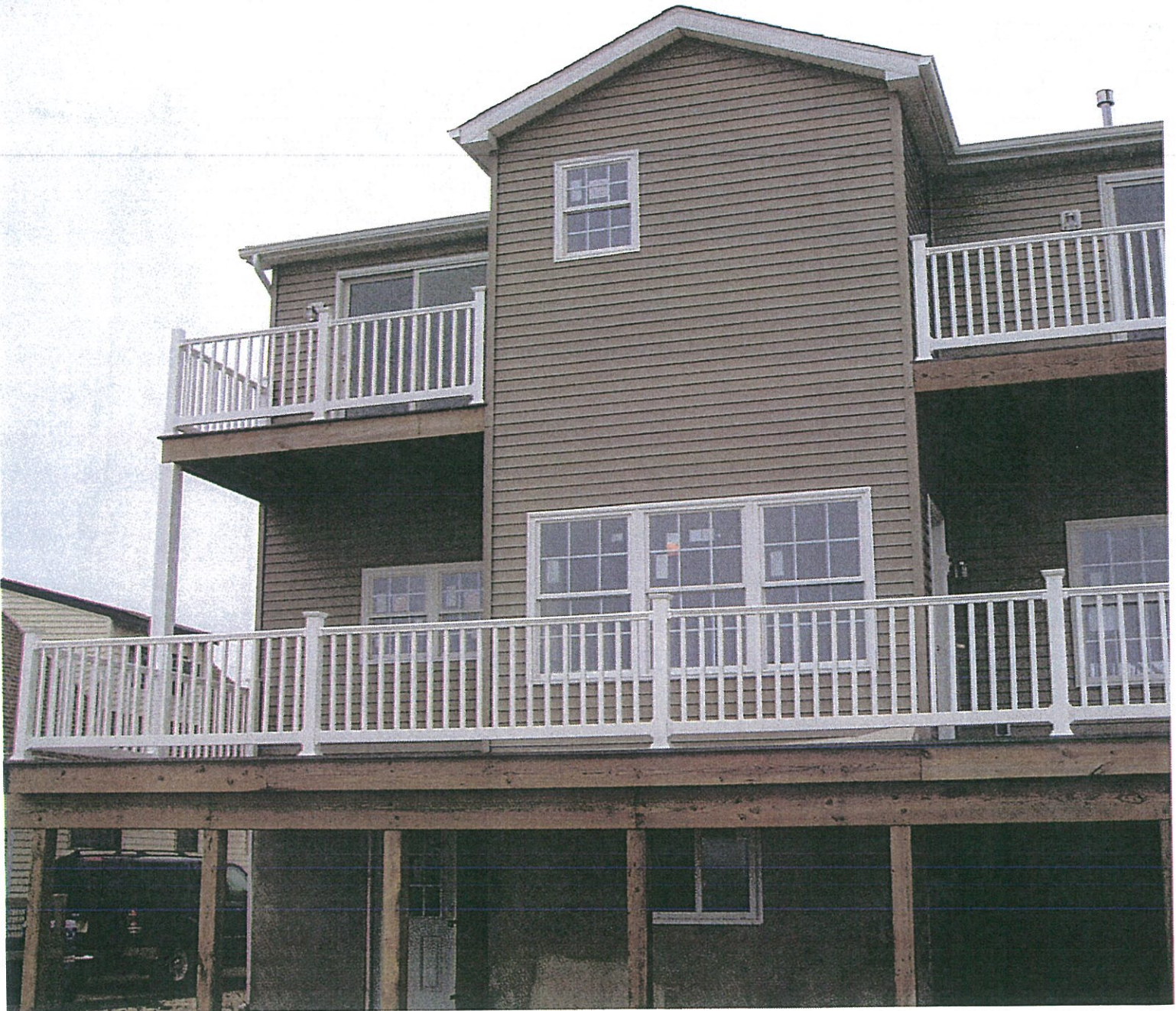
REAR VIEW (4/7/2008)